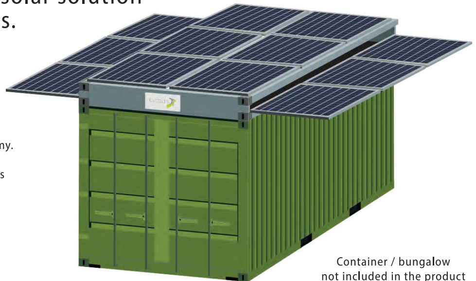
Container / bungalow not included in the product

This system can also travel on a 20' container («Twist- Lock») in a high-cube mode.